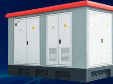
MONOBLOK BETON KÖŞK MONOBLOCK CONCRETE KIOSKS

DISTRIBUTION AND TRANSFORMER SUBSTATIONS